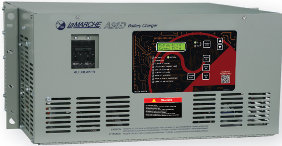
Unit Shown with LCD Display

Steady state output voltage remains within \pm 0.5\% of the setting from no load to full load and for AC input voltages within \pm 10\% of the nominal input voltage. The model A36D is internally filtered to be no greater than 32dBm ("C" message weighting) and 30 millivolts RMS for all conditions on input voltage and output load with or without batteries connected. This allows the A36D to be used as a battery eliminator.