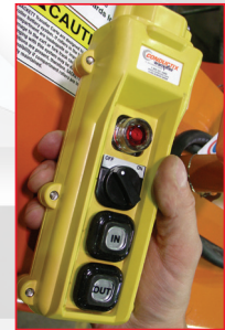
Remote Push Button Pendant