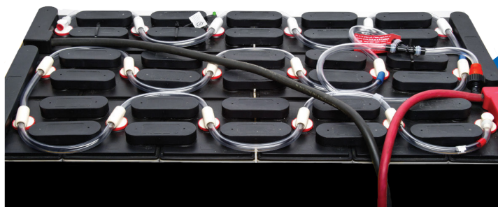
Optional Single-Point Watering System