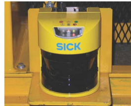
SICK Proximity Laser