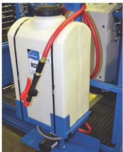
On Board Watering