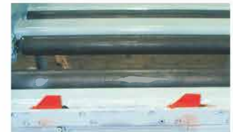
Mechanical Flip-Up Stops