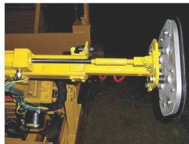
Hydraulic Extension Cylinder