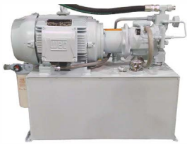
Horizontal Hydraulic Power Unit