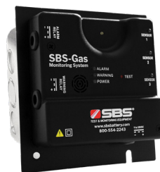
2-Gang Junction Box Hardwired AC and/or DC (optional)