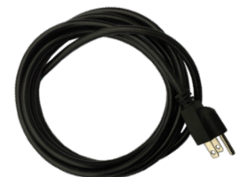
18 AWG AC Cord (optional)