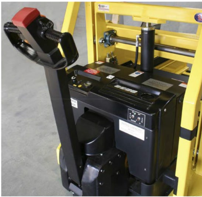
WBP Control Pod