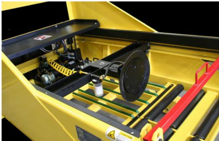
Vacuum Cup Assembly